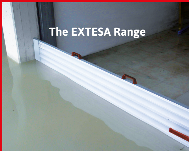
Example of application of the Acquastop Extesa anti-flooding barrier